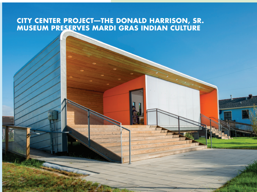
CITY CENTER PROJECT—THE DONALD HARRISON, SR. MUSEUM PRESERVES MARDI GRAS INDIAN CULTURE